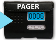
Caregiver Pocket Pager