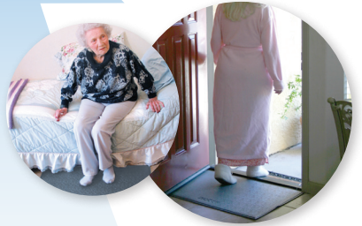
CordLess Floor Mats