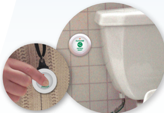
Wireless Nurse Call Button