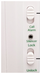
Call / Alarm Switch