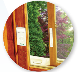
Wireless Window/Door Exit Alarm