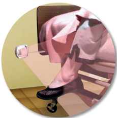
Wireless Motion Sensor