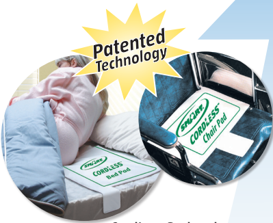
CordLess Bed and Chair Sensor Pads